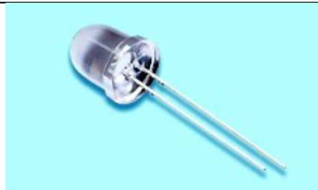
Package Dimensions (mm)

110.0*13.2mm round (coniform), without flange LED lamps